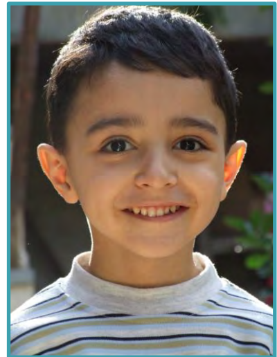
Dawson Place helps abused kids learn to smile again.