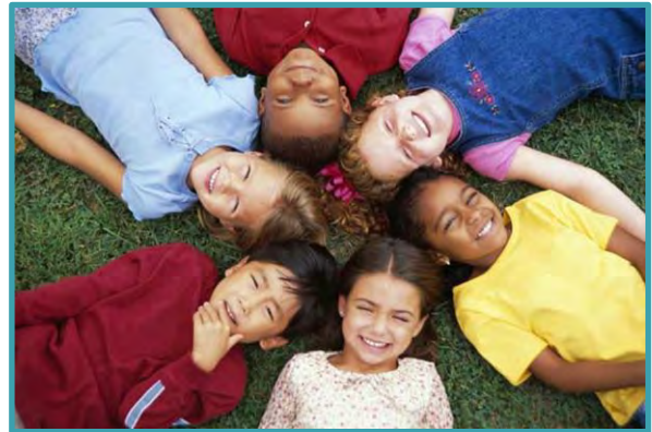
Dawson Place helps kids get back to being kids!